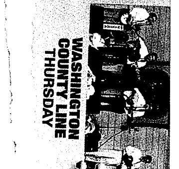
WASHINGTON COUNTY LINE THURSDAY