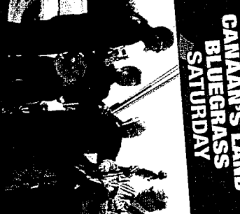
CANAAN'S LAND BLUEGRASS SATURDAY