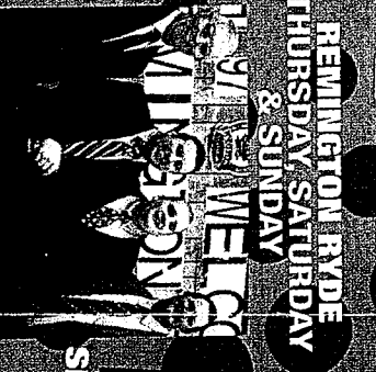
REMINGTON RYDE THURSDAY, SATURDAY & SUNDAY