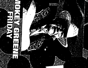
SMOKEY GREENE FRIDAY